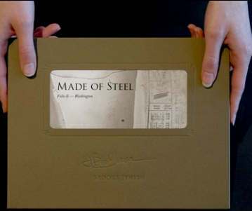
8x10 1/2" Finished size, 12 images

Each folio is signed and numbered. Numbers 1-50 are reserved for complete sets.