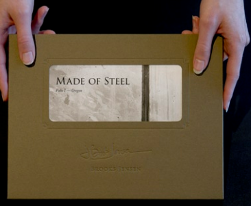
8x10½" Finished size, 12 images