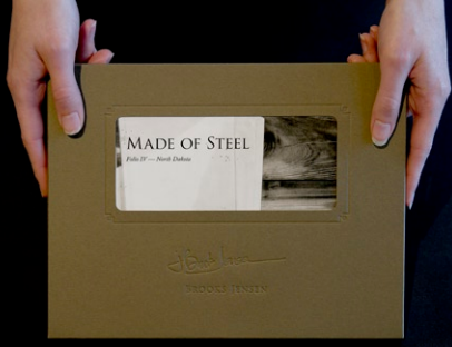
8x10½" Finished size, 12 images