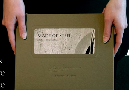
8x10½" Finished size, 12 images